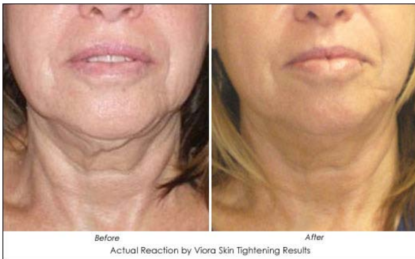
Post 3 Treatments

NEW Home Microdermabrasion Home Microdermabrasion Machine Seen on Newsweek, Tyra Banks Show